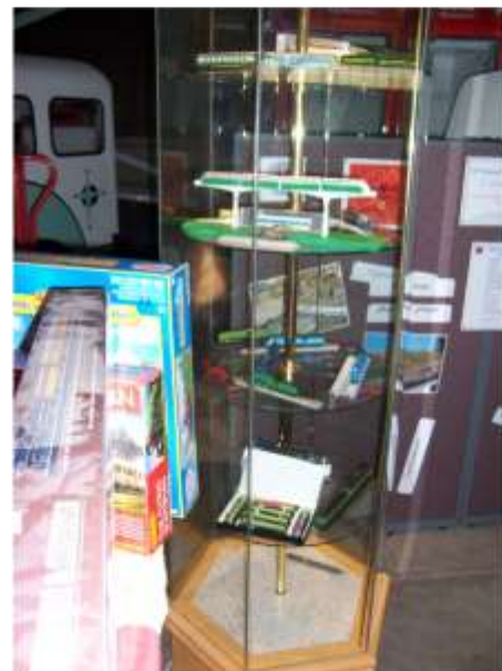
Our Information stand at the Adelaide Model Train Show.