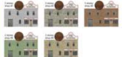
TWO STOREY SHOP WITH ACCOMMODATION (Circa 1890s)

We thank them and trust delegates continue to support them as manufacturers of excellent card models