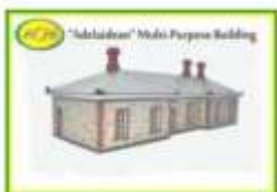
TYPICAL 19th CENTURY VICTORIAN STYLE BUILDING (Circa 1870s)