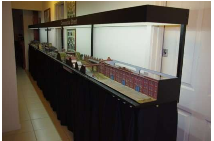
Port Dock & Commercial Street