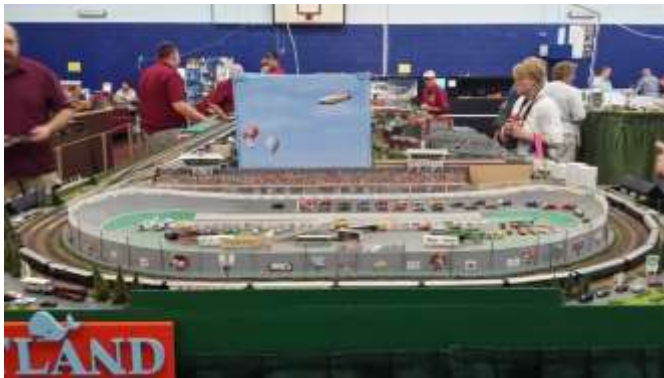
Portland's Nascar Raceway